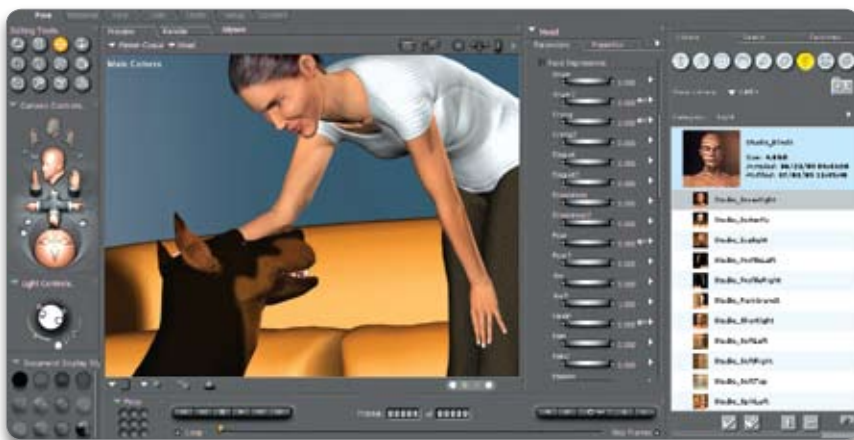
Pose, Face, Hair, Material, Cloth, Setup and Content rooms provide all the tools you'll need